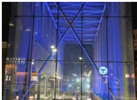
Government Center MBTA Station