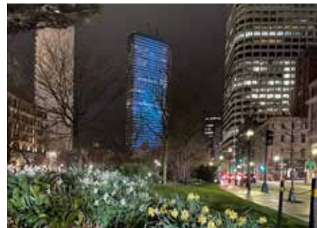
1 Financial Center