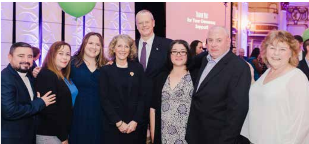
Foster Parents and Volunteers with MSPCC's Encompass Program with Governor and First Lady Baker

Check out the full photo album at: mspcc.org/tp2022/